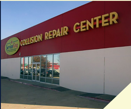
Service King 3021 Eagle

The waste from this business is always properly labeled and the outside of the shop is free of debris and spills. They maintain the inside of the repair shop clean and organized.