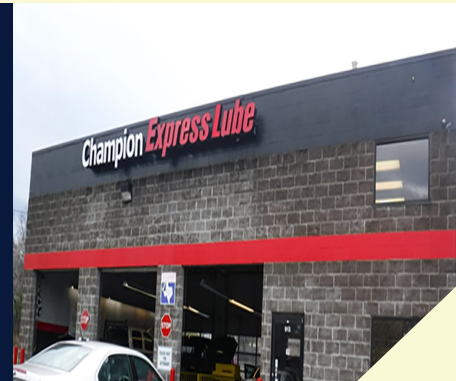
Champions Xpress Lube 913 Hill

This body shop labels waste properly, keeps the paint booth well maintained, and has no wet sanding discharge issues. Outside storage of used oil is in a covered secondary containment unit. The lot is also properly maintained.