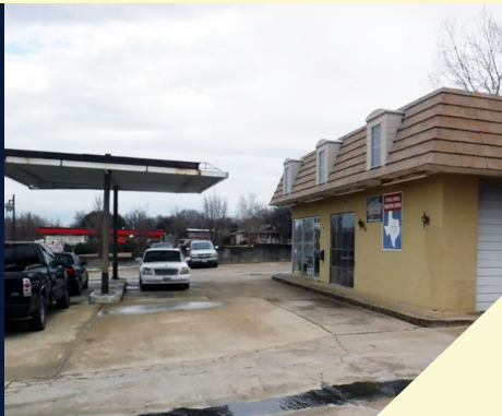
North Carrier Automotive 602 E. Main

The waste from this business is always properly labeled and the outside of the shop is free of debris and spills. They maintain the inside of the repair shop clean and organized.