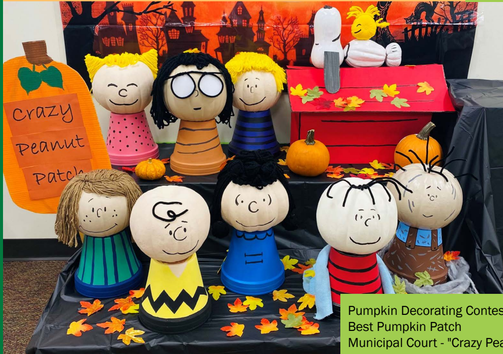
Pumpkin Decorating Contest Group Winner Best Pumpkin Patch Municipal Court - "Crazy Peanut Patch"