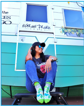
Go Places at the Grand Prairie Tourist Center