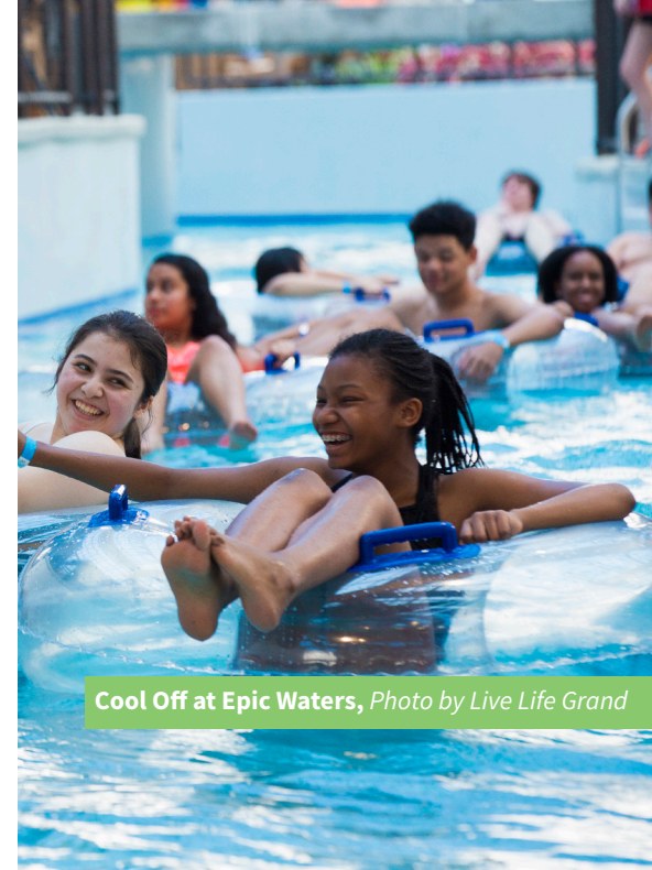
Cool Off at Epic Waters