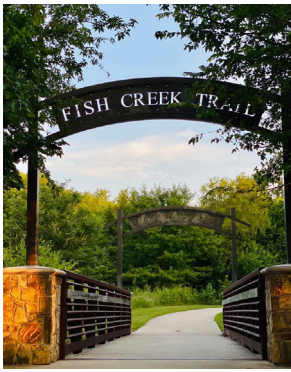
Fish Creek Trail