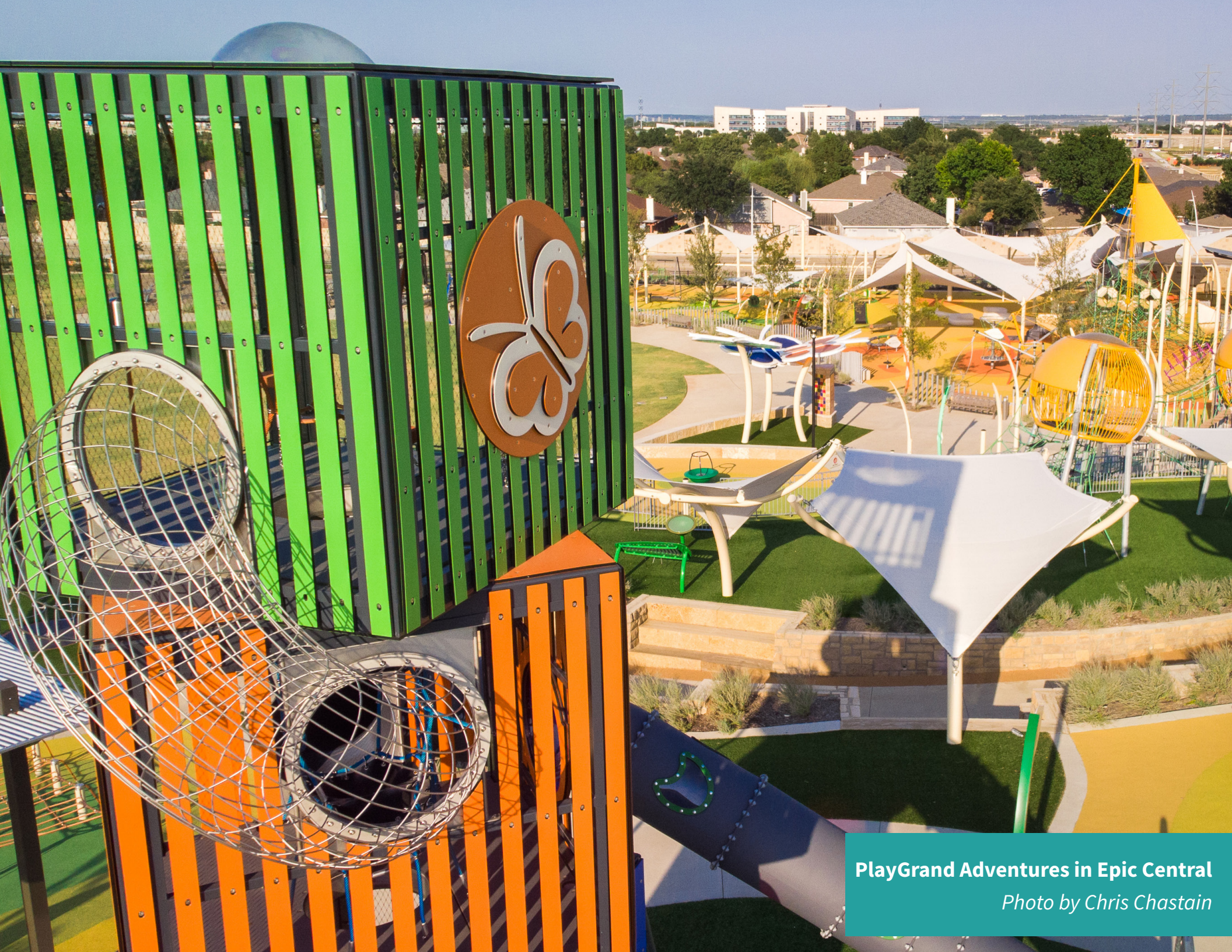
PlayGrand Adventures in Epic Central