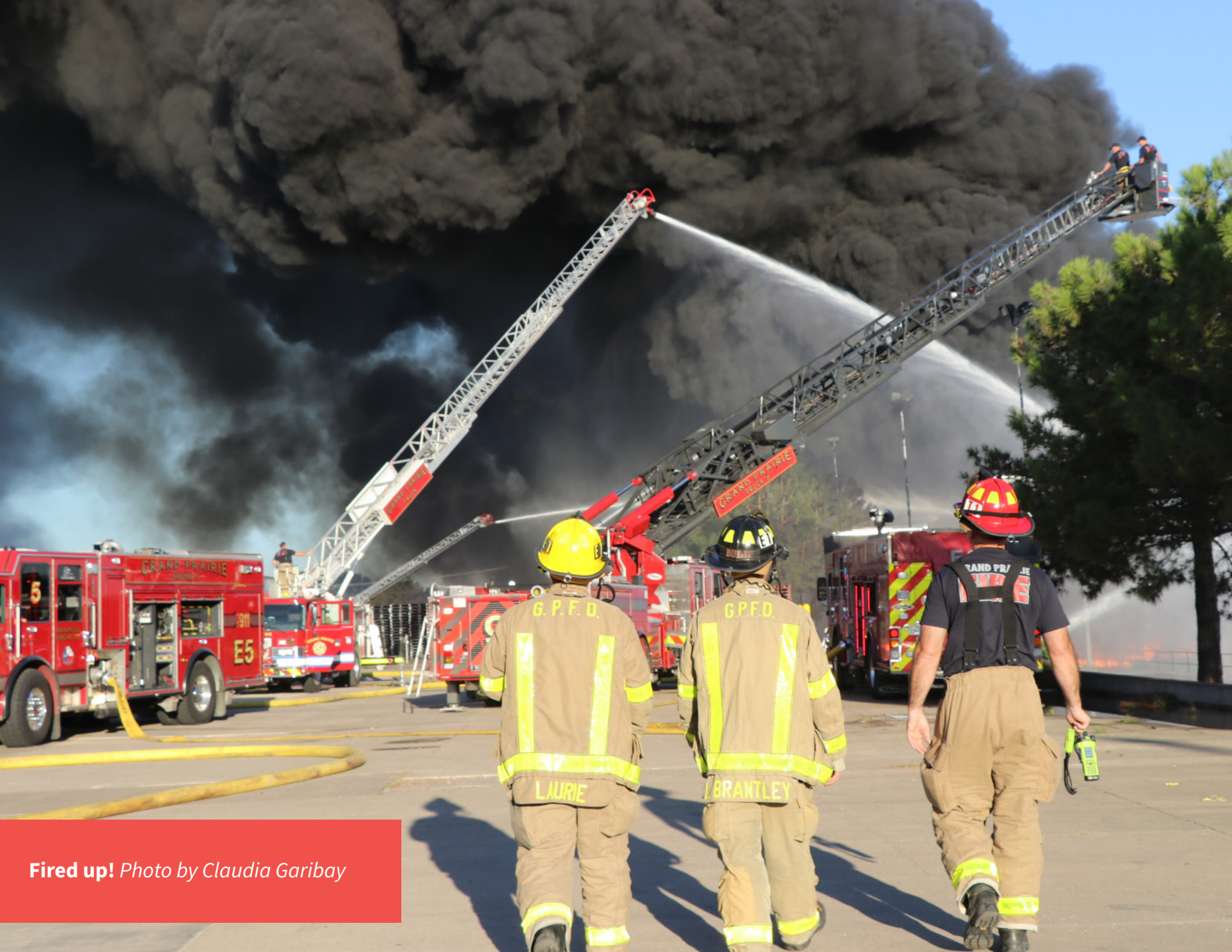
Fired up!