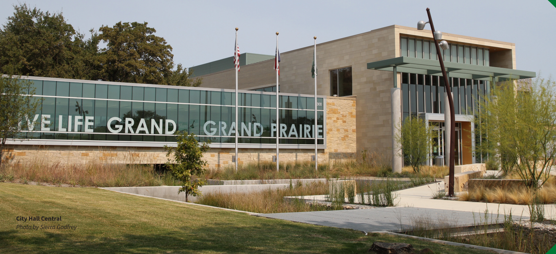
City Hall Central