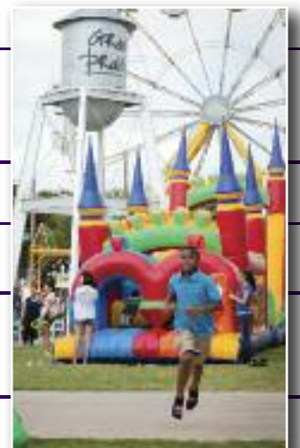
Main Street Festival is so fun.

Began our own Police Academy for recruits