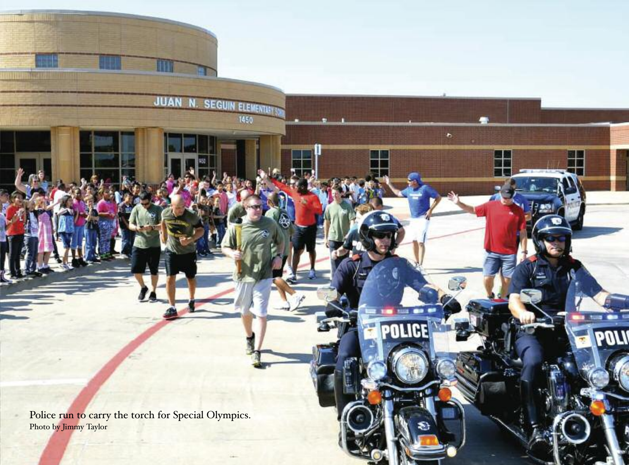
Police run to carry the torch for Special Olympics.

For the latest information on everything in Grand Prairie, log on to gptx.org , find "City of Grand Prairie" on Facebook, or cityofgptx on YouTube.com