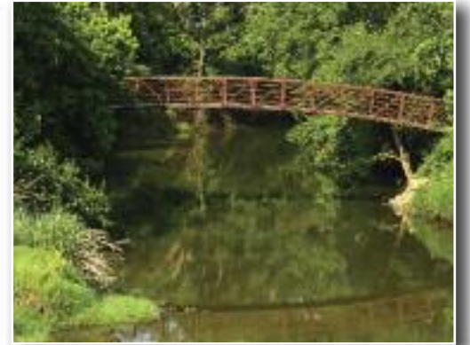
Bridge to serenity in Loyd Park.