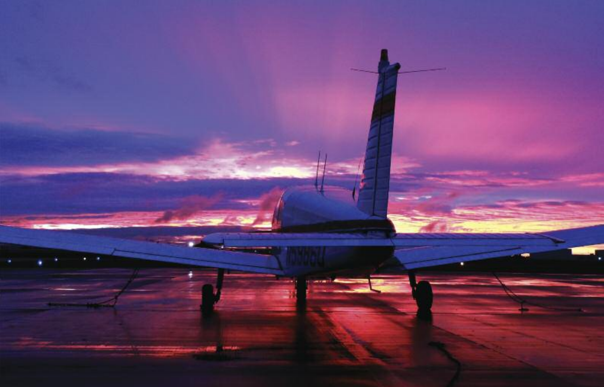
Flying pretty at Grand Prairie Airport and Restaurant.

For the latest information on everything in Grand Prairie, log on to gptx.org , find "City of Grand Prairie" on Facebook, or cityofgptx on YouTube.com