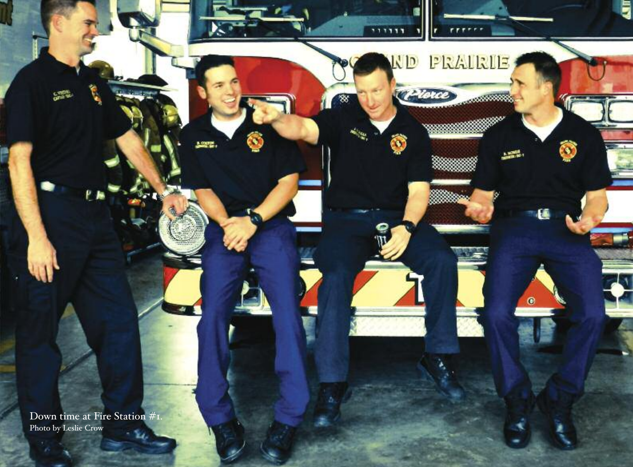
Down time at Fire Station #1.

For the latest information on everything in Grand Prairie, log on to gptx.org , find "City of Grand Prairie" on Facebook, or cityofgptx on YouTube.com