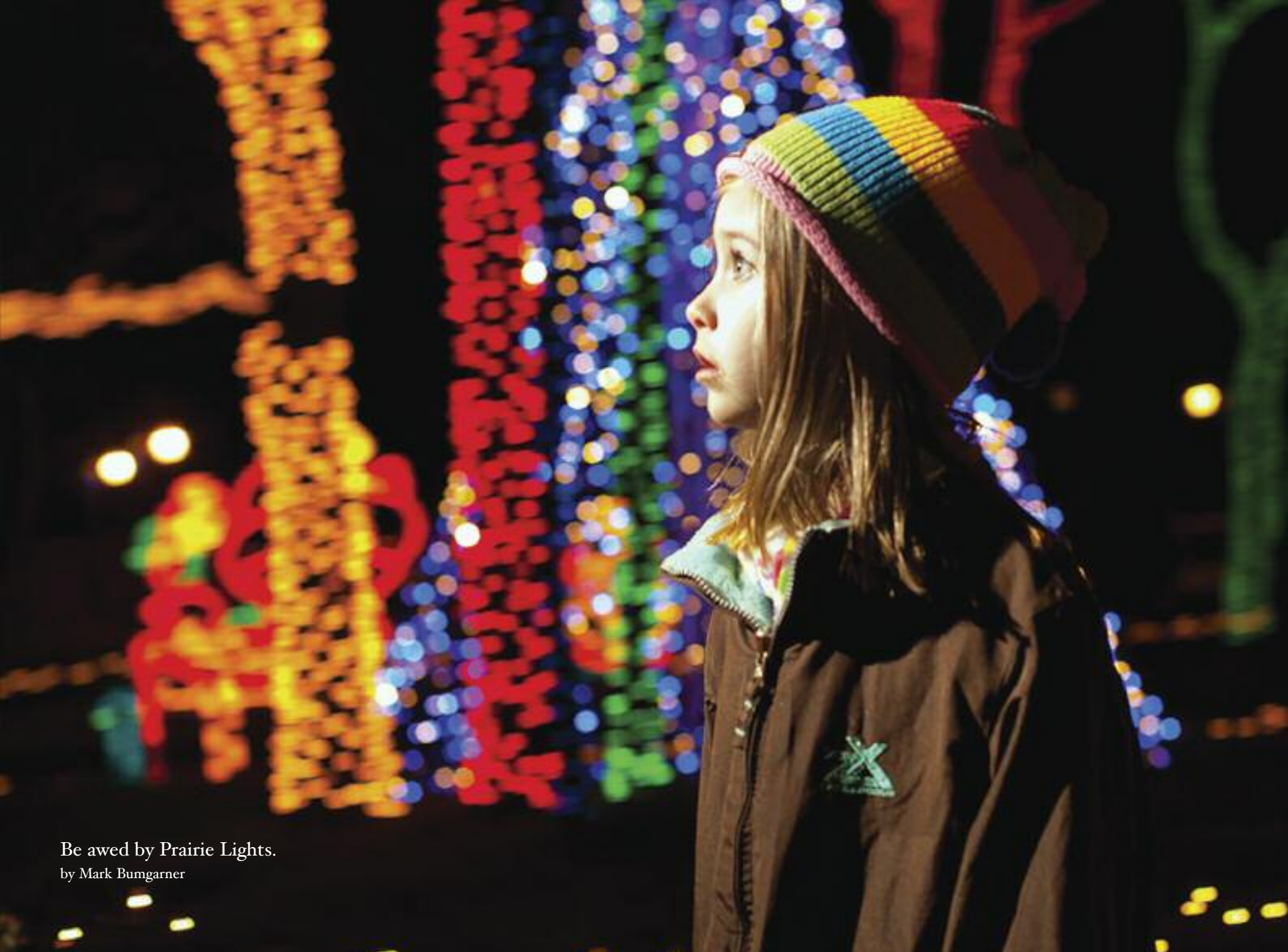
Be awed by Prairie Lights. by Mark Bumgarner

For the latest information on everything in Grand Prairie, log on to gptx.org , find "City of Grand Prairie" on Facebook, or cityofgptx on YouTube.com