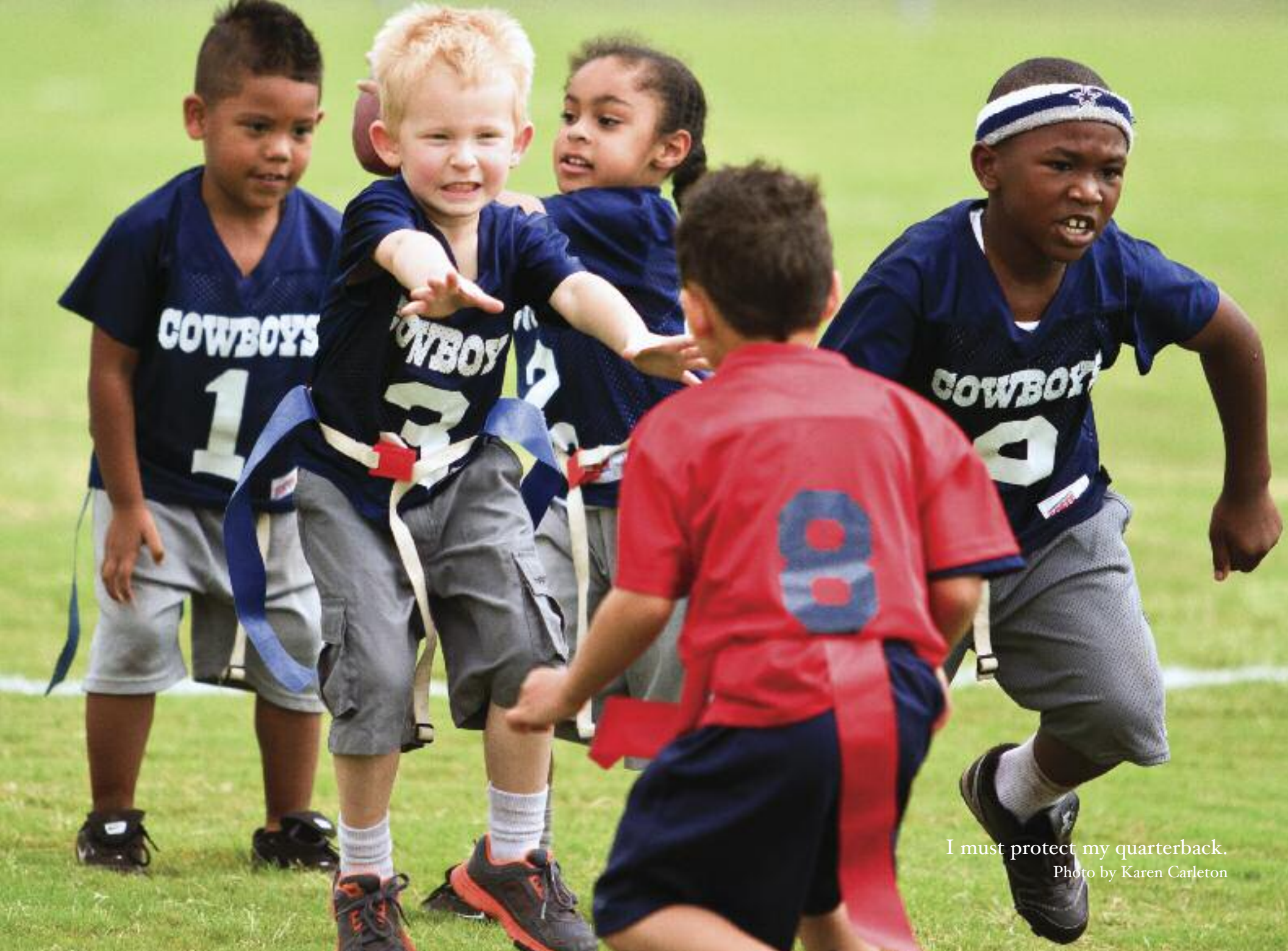
I must protect my quarterback.

For the latest information on everything in Grand Prairie, log on to gptx.org , find "City of Grand Prairie" on Facebook, or cityofgptx on YouTube.com