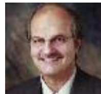
Tony Shotwell Place 5