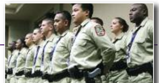
Police Recruits