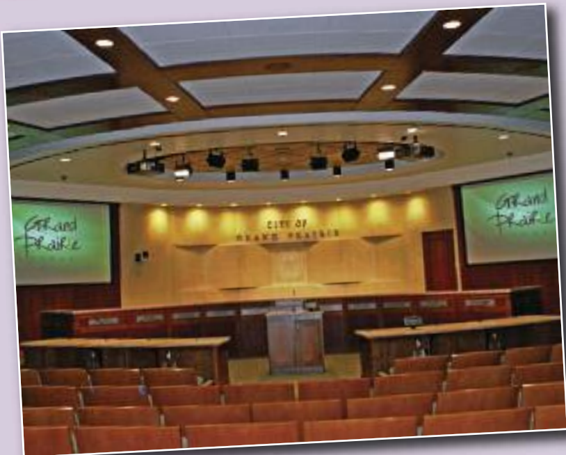
The newly renovated City Council Chambers opened summer 2012.