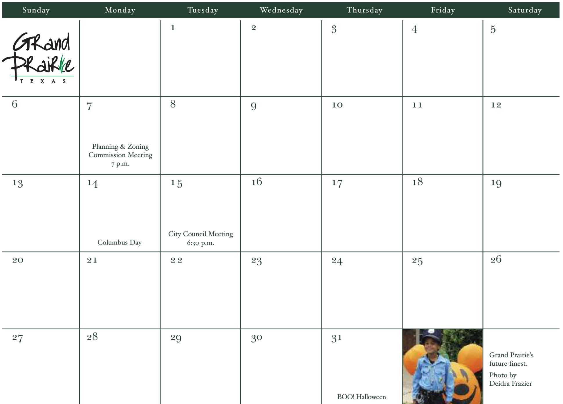
Grand Prairie's future finest.