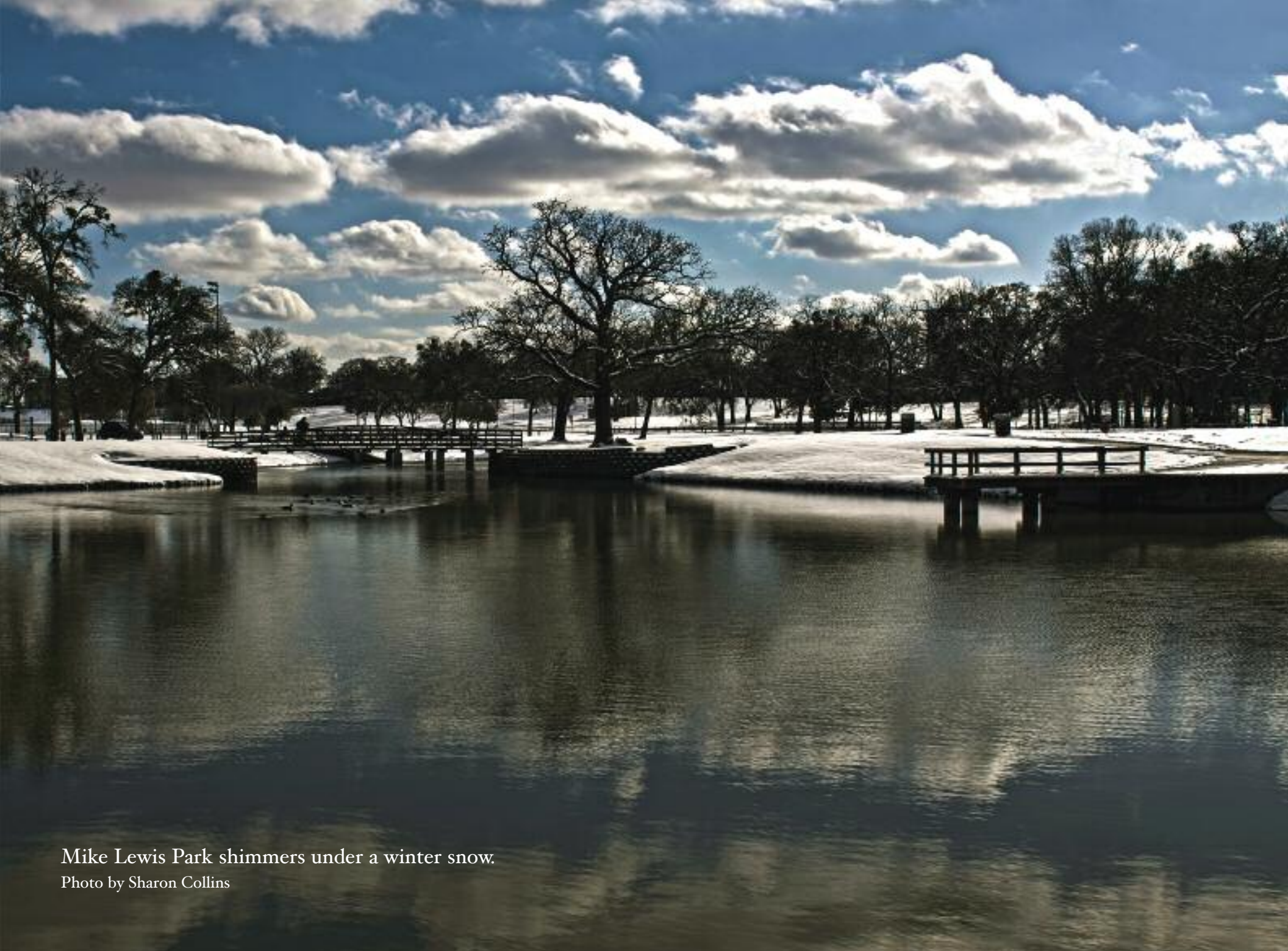
Mike Lewis Park shimmers under a winter snow.

For the latest information on everything in Grand Prairie, log on to gptx.org , find “City of Grand Prairie” on Facebook, or cityofgptx.com on YouTube.com