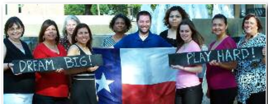
City employees Dream Big, Play Hard.