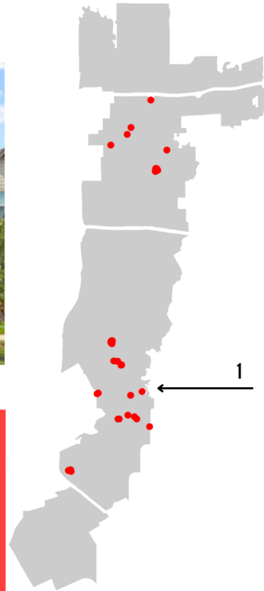
Locations based on building permits approved.