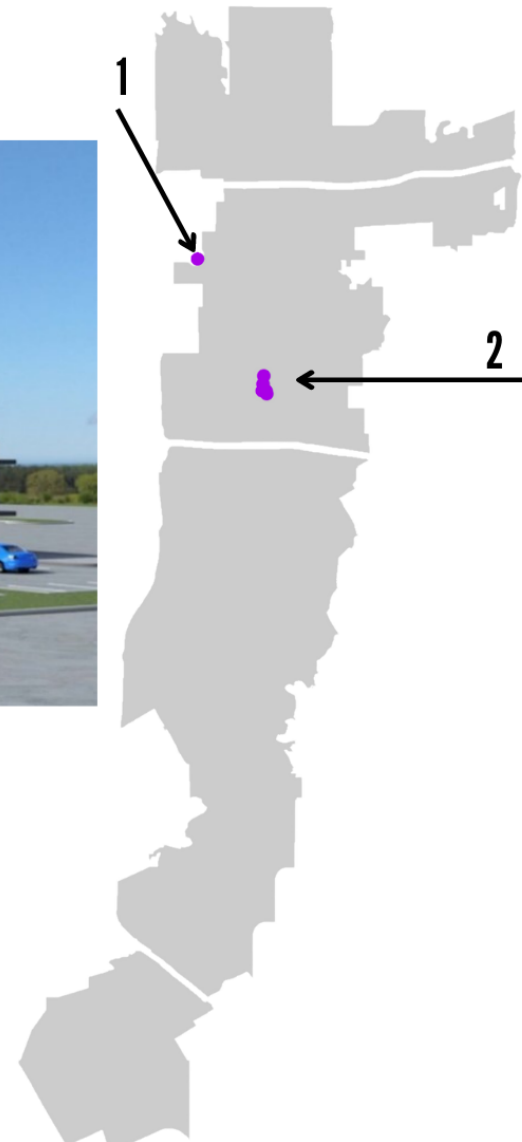
Locations based on building permits approved.