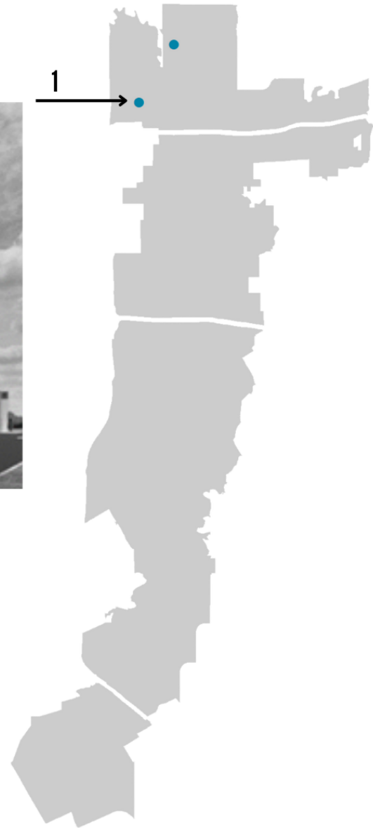
Locations based on building permits approved.