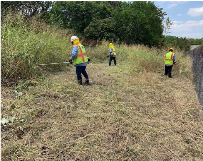
Streets/Public Works employees use covering to protect themselves from the sun. Employees are also provided with ice water, Gatorade, cooling towels. Cooling disks to wear under hard hats will be available to employees soon.