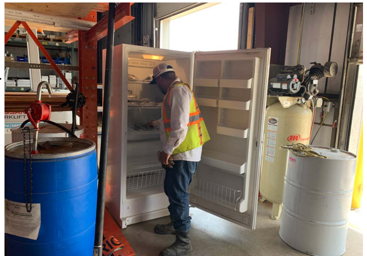
Ice pops are available for Public Works employees at the Service Center.

Questions? Contact the Office of Emergency Management at 972-237-8333 or oem@gptx.org