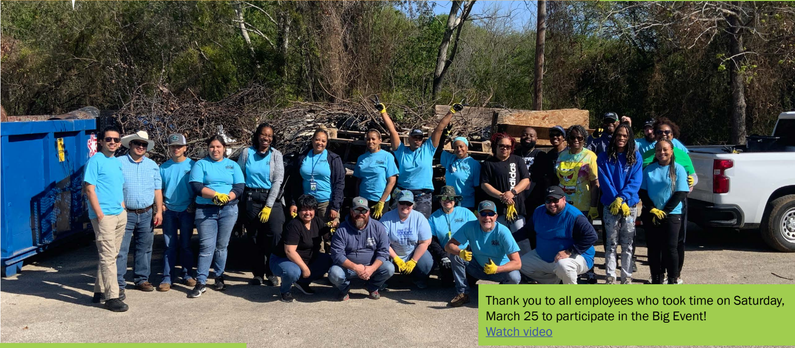
Thank you to all employees who took time on Saturday, March 25 to participate in the Big Event! Watch video