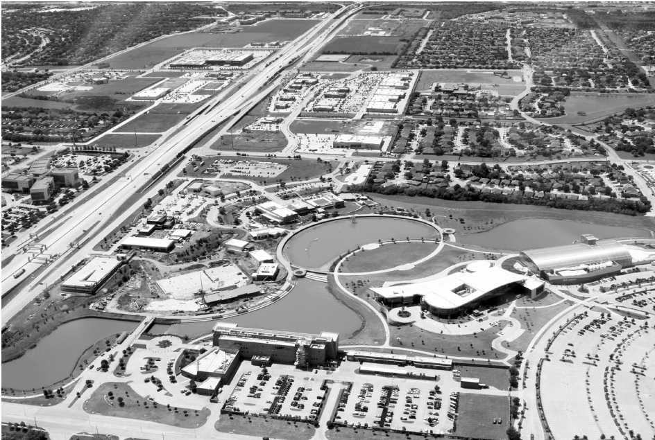
May 2022 aerial photo of EpicCentral

Construction is well underway on the EpicCentral development just west of SH 161 between Arkansas Lane and Warrior Trail. The development will include hotels, a convention center, restaurants and an outdoor open space with a covered stage for events, concerts and programs along with interactive technology for entertainment. At night, visitors will be able to enjoy a light show in the adjacent lake. One EpicCentral restaurant is already open—Chicken N Pickle. Hotel and restaurant estimated opening dates are as follows: